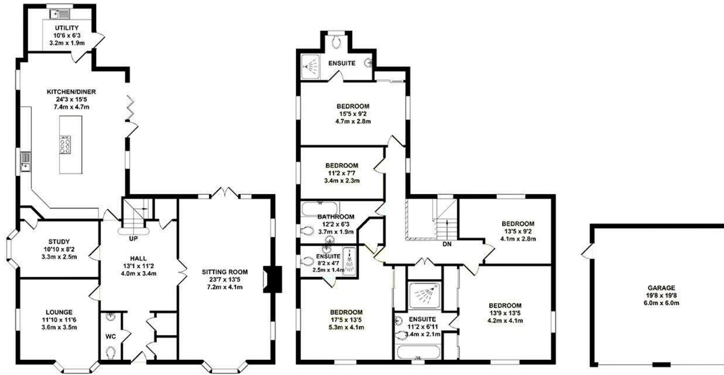
GROUND FLOOR APPROX. FLOOR AREA 1262 SQ.FT. (117.28 SQ.M.)