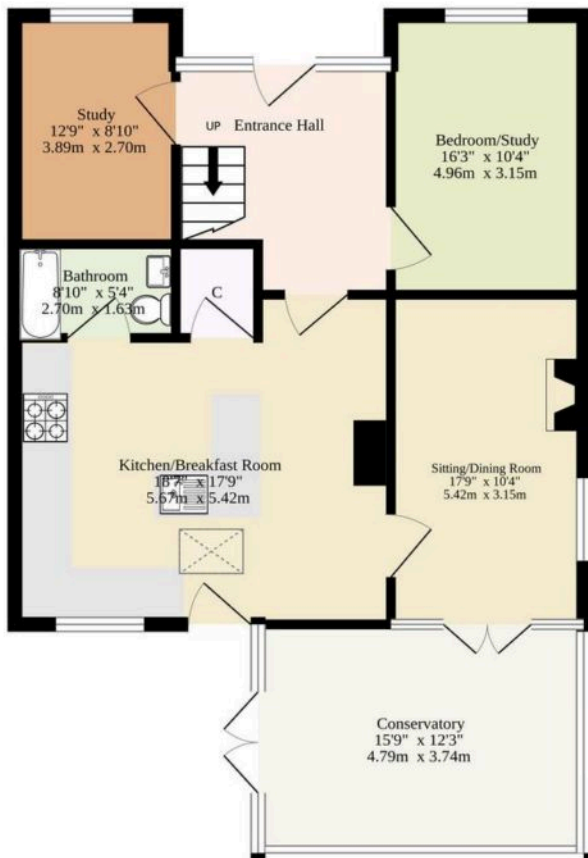
Ground Floor 1181 sq.ft. (109.7 sq.m.) approx.