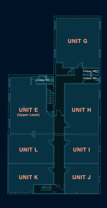
Proposed First Floor