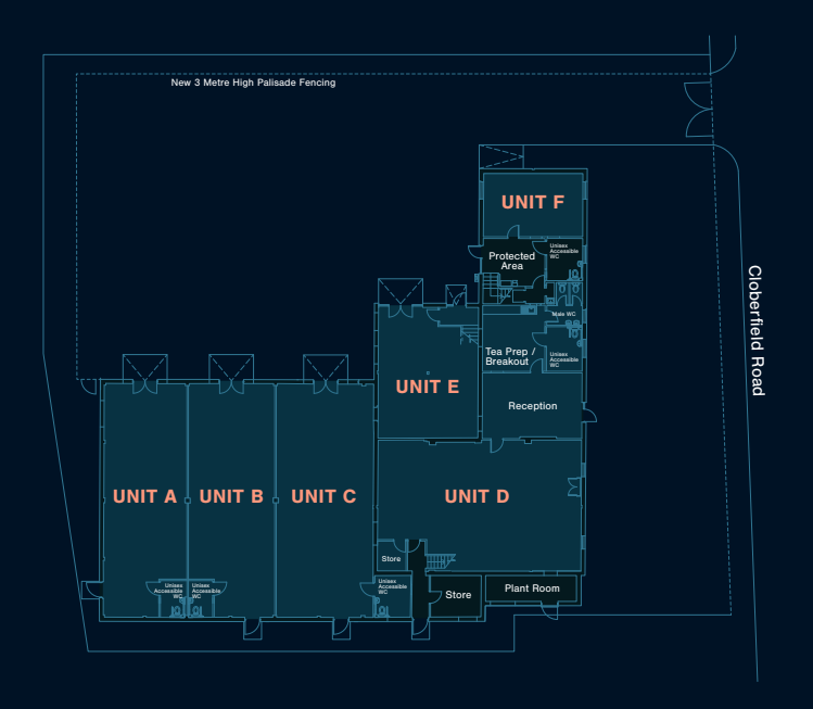
Proposed Ground Floor