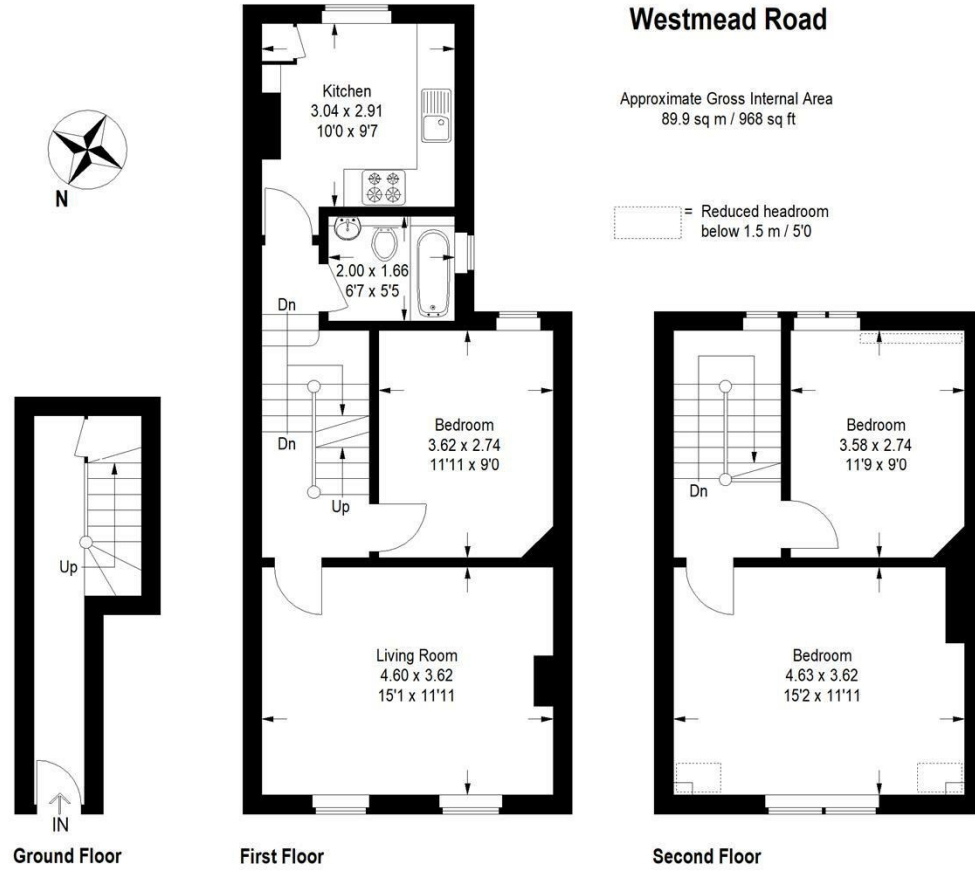
Illustration for identification purposes only, measurements are approximate, not to scale. FloorplansUsketch.com © 2022 (ID 904005)