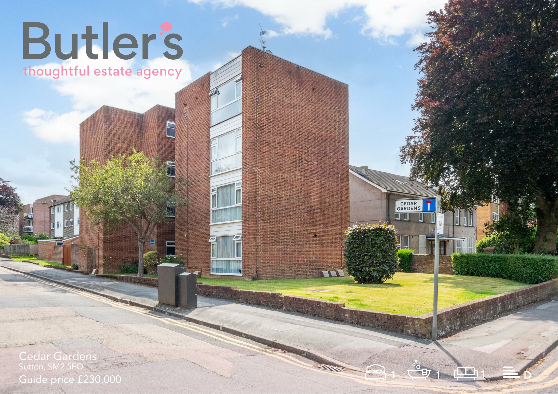
Cedar Gardens Sutton, SM2 5EQ Guide price £230,000