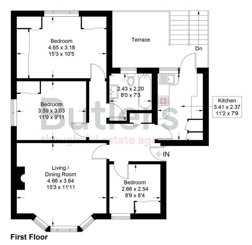
Illustration for identification purposes only, measurements are approximate,

Approximate Gross Internal Area = 77.1 sg m / 830 sg ft