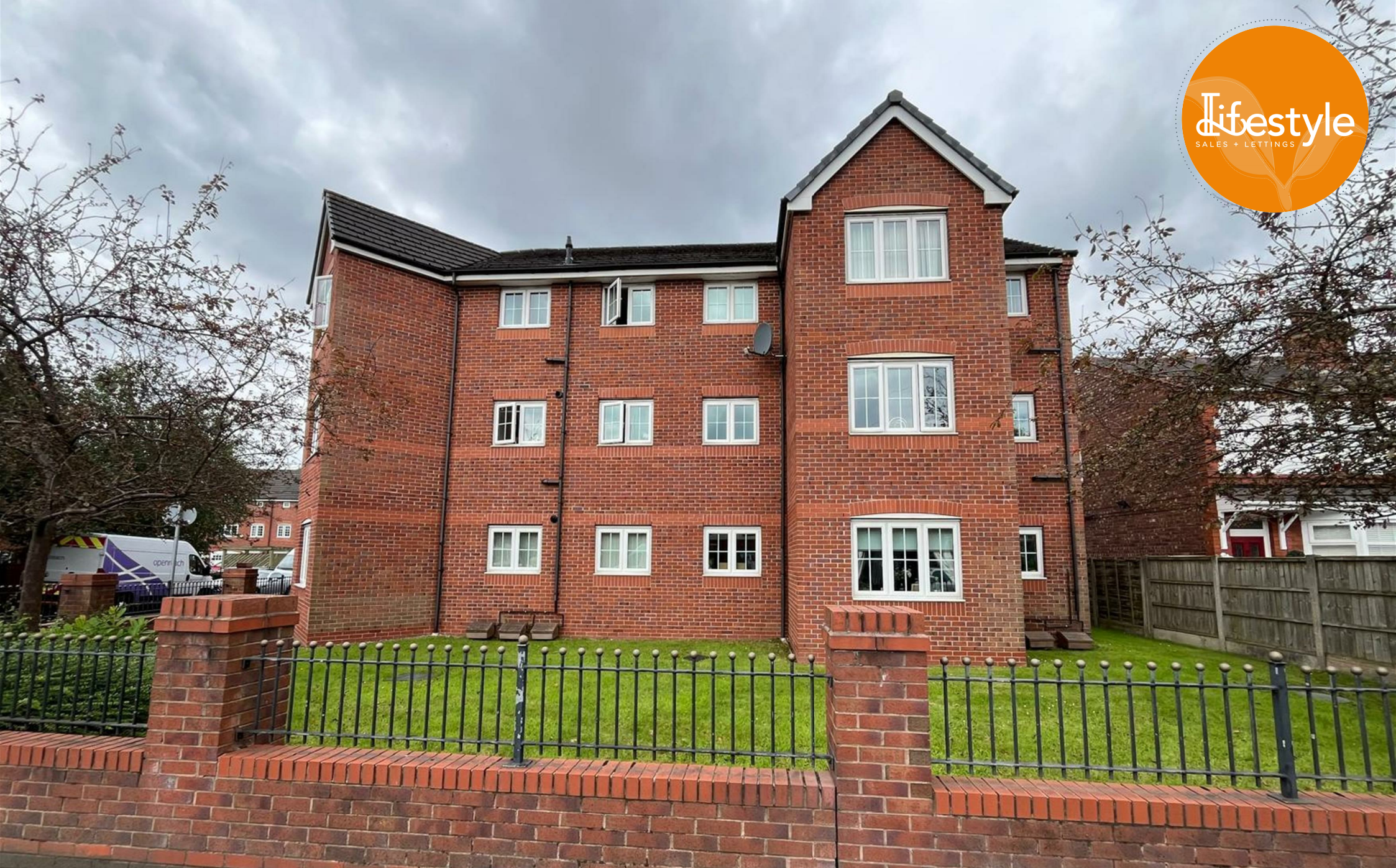
16 Brentwood Grove, Leigh, WN7 1UG Price £100,000