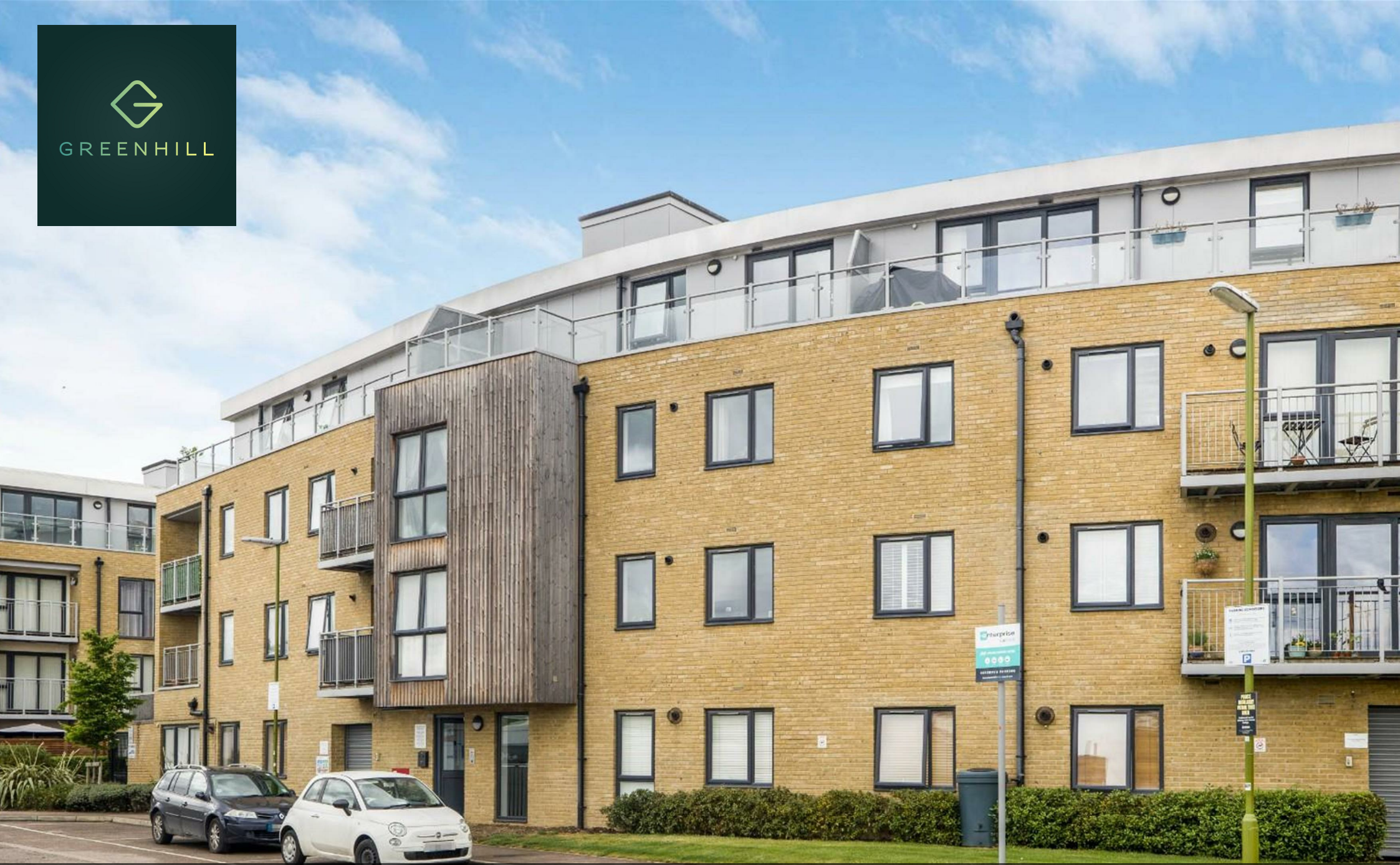
Smeaton Court Hertford, SG13 7AU Offers in excess of £315,000