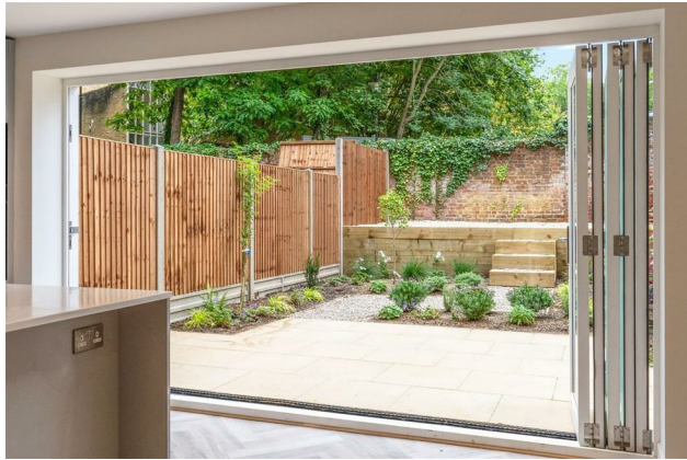
Living in Hertford