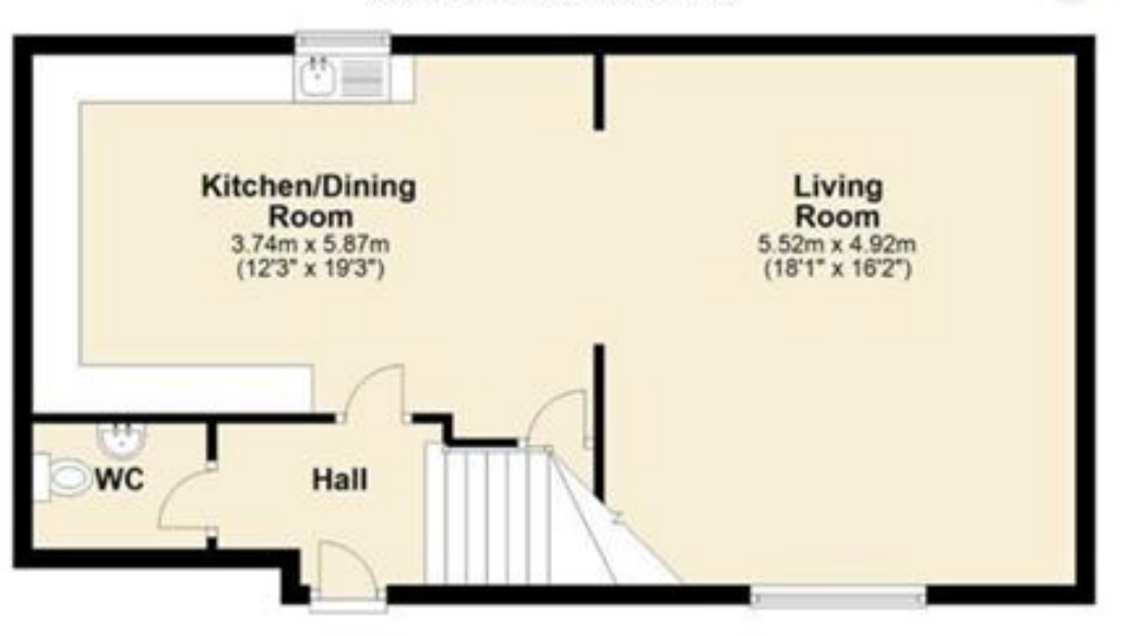
First Floor Approx. 58.3 sq. metres (627.0 sq. feet)