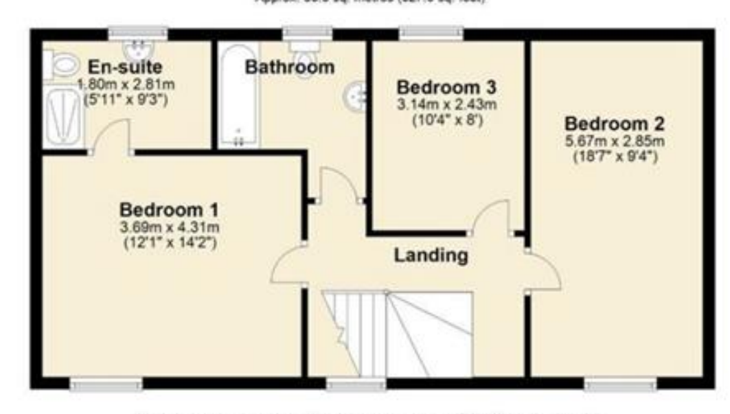
Total area: approx. 117.1 sq. metres (1259.9 sq. feet)