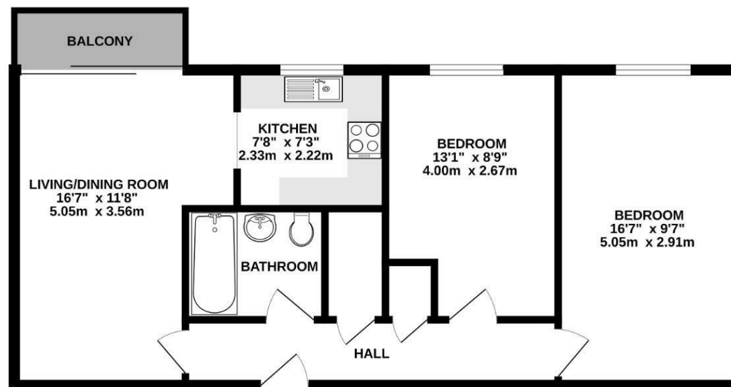
SECOND FLOOR 614 sq.ft. (57.0 sq.m.) approx.