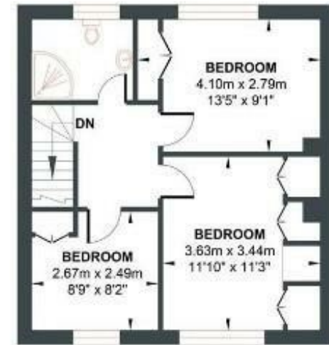
FIRST FLOOR Approximate Floor Area 422.59 sq ft (39.26 sq m)