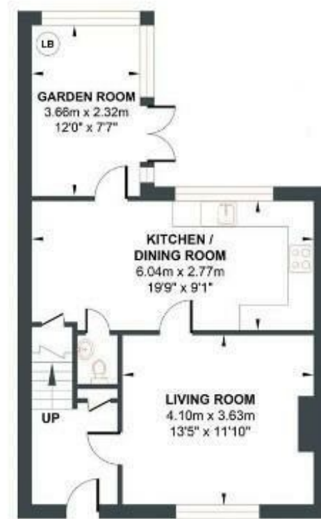
GROUND FLOOR Approximate Floor Area 516.45 sq ft (47.98 sq m)

Brighton & Hove and Horsham are conveniently accessible, offering cosmopolitan delights and further shopping opportunities.