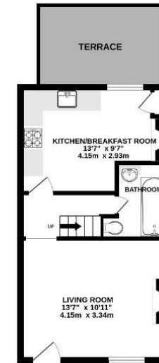
GROUND FLOOR 327 sq ft (30.4 sq m) approx.