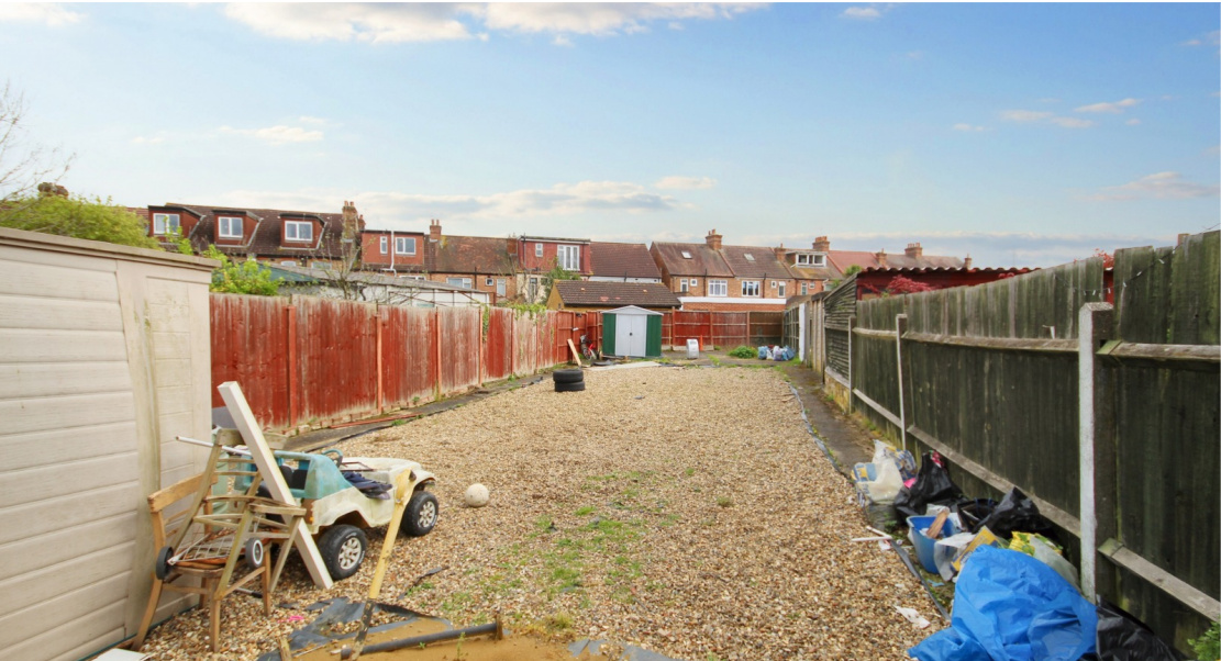
Offered with no further chain and located just a short walk from Sudbury Town Station is this Spacious Three Bedroom First floor flat. Internally you will find a good size lounge, family bathroom, separate WC, kitchen and three double bedrooms. Other benefits include a share of the rear garden and a share of freehold. All in all, making this an ideal property not to be missed.