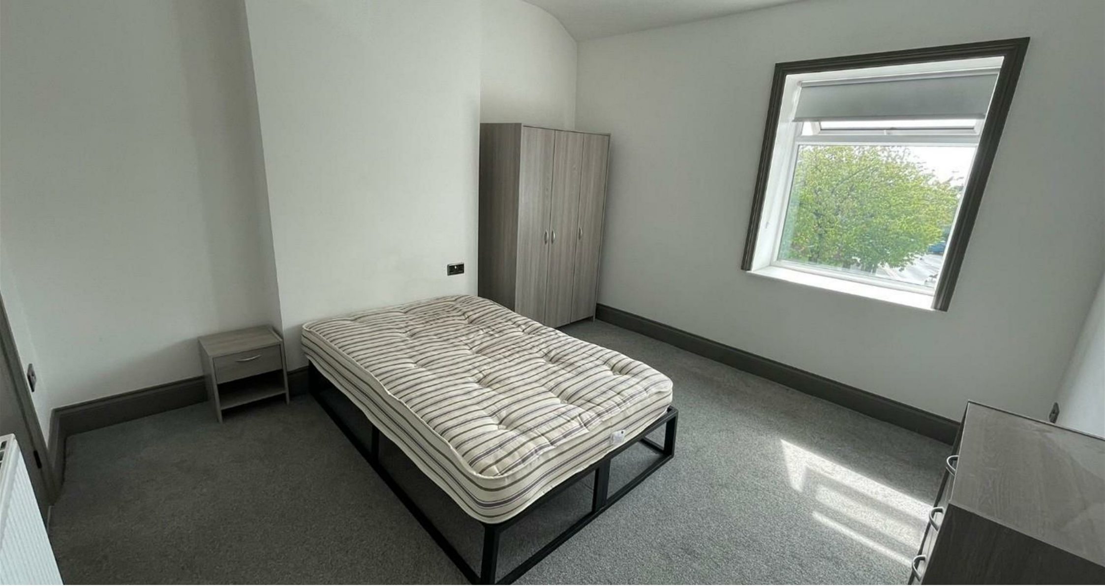
Room 9, 84-86 Eaves Lane, Chorley, PR6 0SU