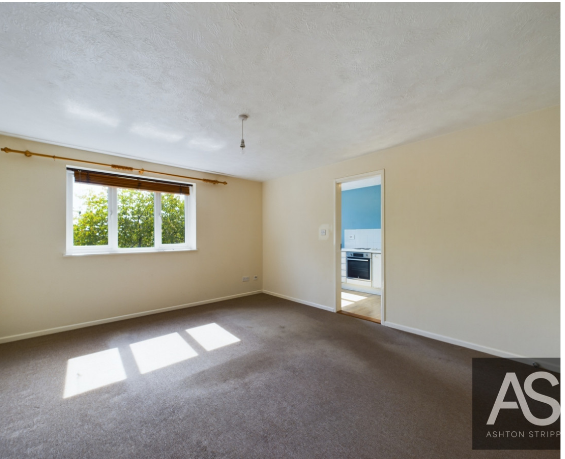
Guide price £190,000 - £195,000

Two-bedroom, first-floor flat in good condition, chain-free. Ideal as an investment or for a first-time buyer. Views of the treeline from the kitchen and living room. Allocated parking included and walking distance to the high street.