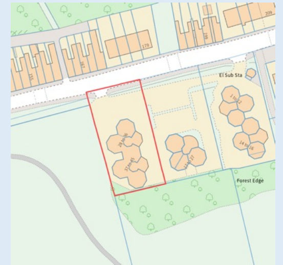
NB. The plan is for identification only.