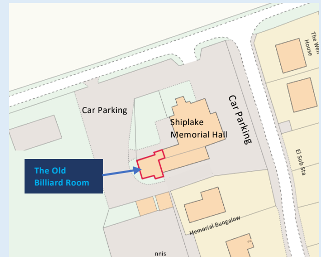
NB. The plan is for identification only.