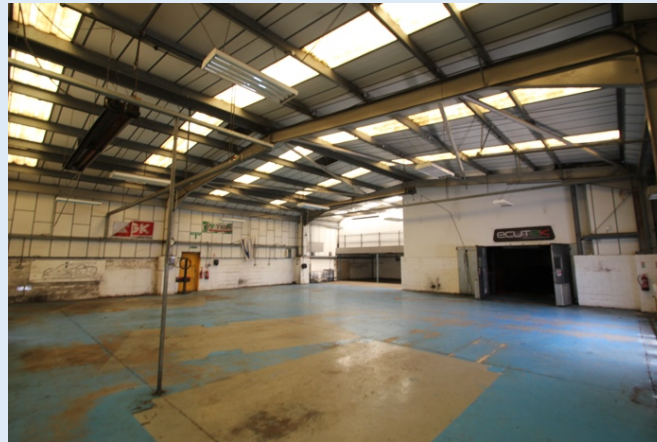
Main Vehicle Service Bay Area & Rolling Road

We understand the property is elected for VAT.