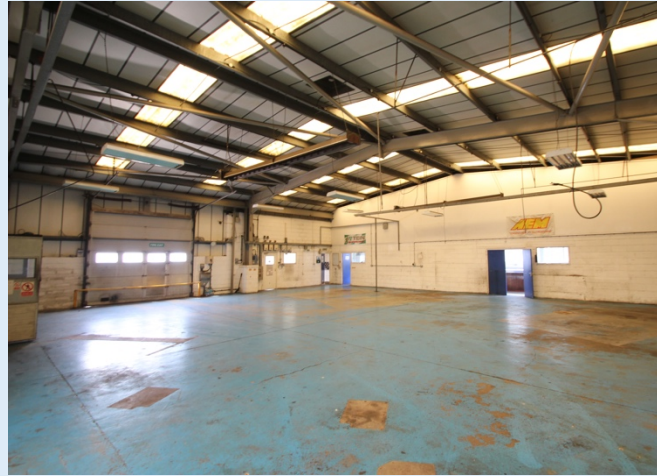
Main Vehicle Service Bay Area & Roller Door

Aylesbury which is the county town of Buckinghamshire is located approx.