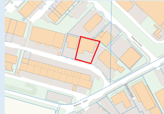
NB. The plan for identification only.