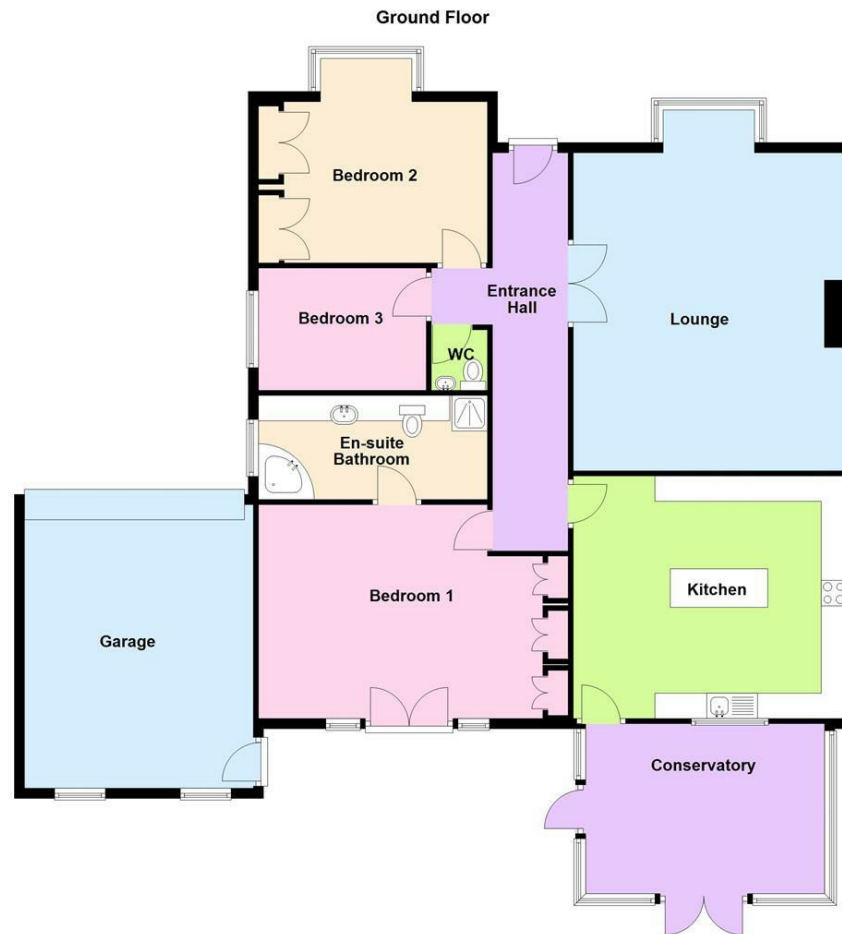
6 Brantingham Road, Elloughton