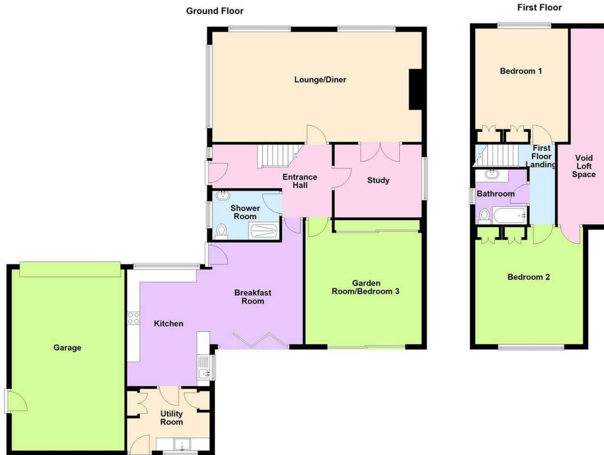
The Sycamores, 12 Beverley Road, South Cave