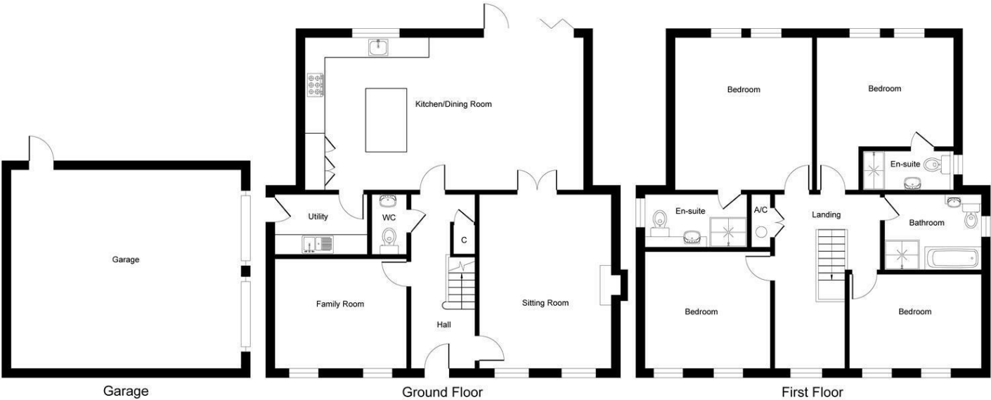
Illustration for identification purposes only, not to scale. Copyright

Please contact our Charles Wright Properties Office on 01394 446483 if you wish to arrange a viewing appointment for this property or require further information.