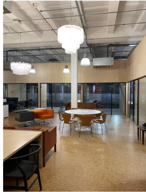
FURNITURE NOW REMOVED