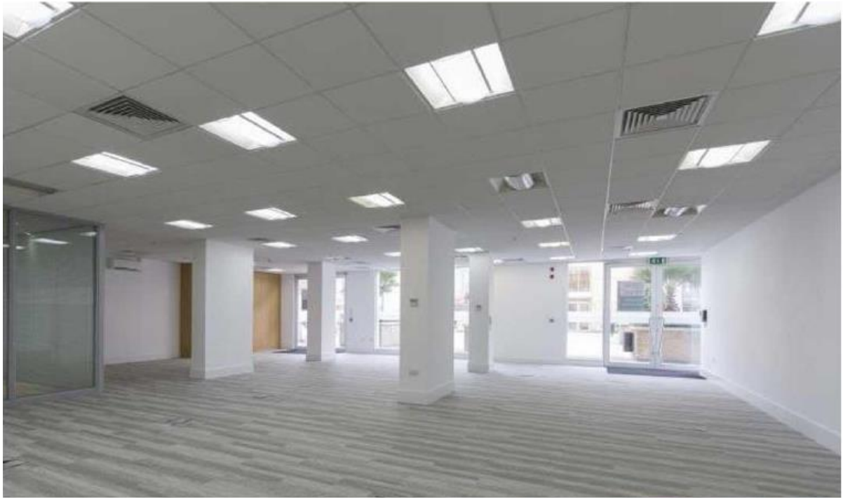
Photo before last occupation