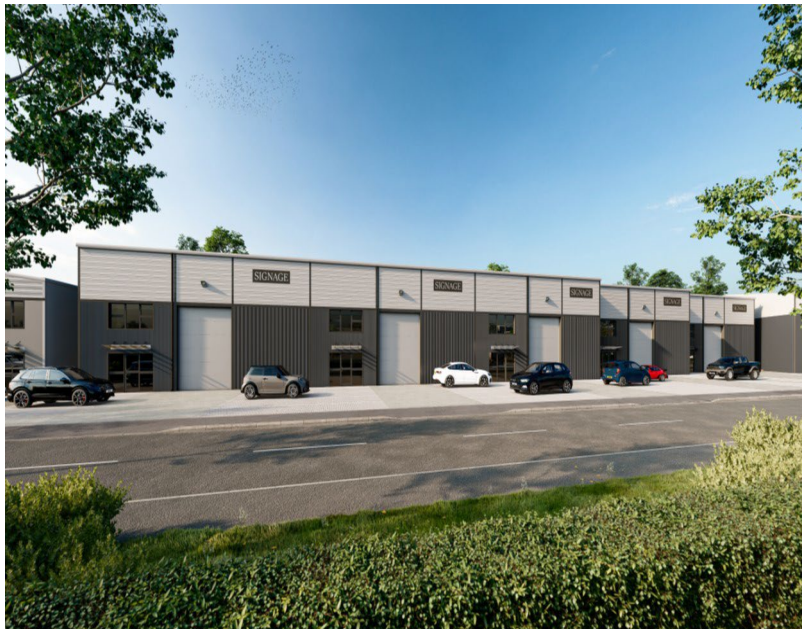
Units 14-18 (proposed)

For more information, visit eddisons.com T: 01480 451578