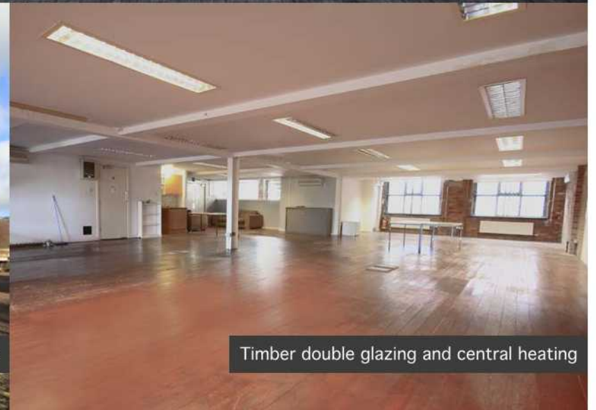
Timber double glazing and central heating