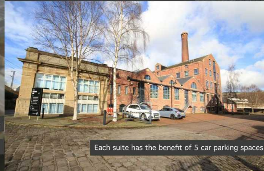
Each suite has the benefit of 5 car parking spaces