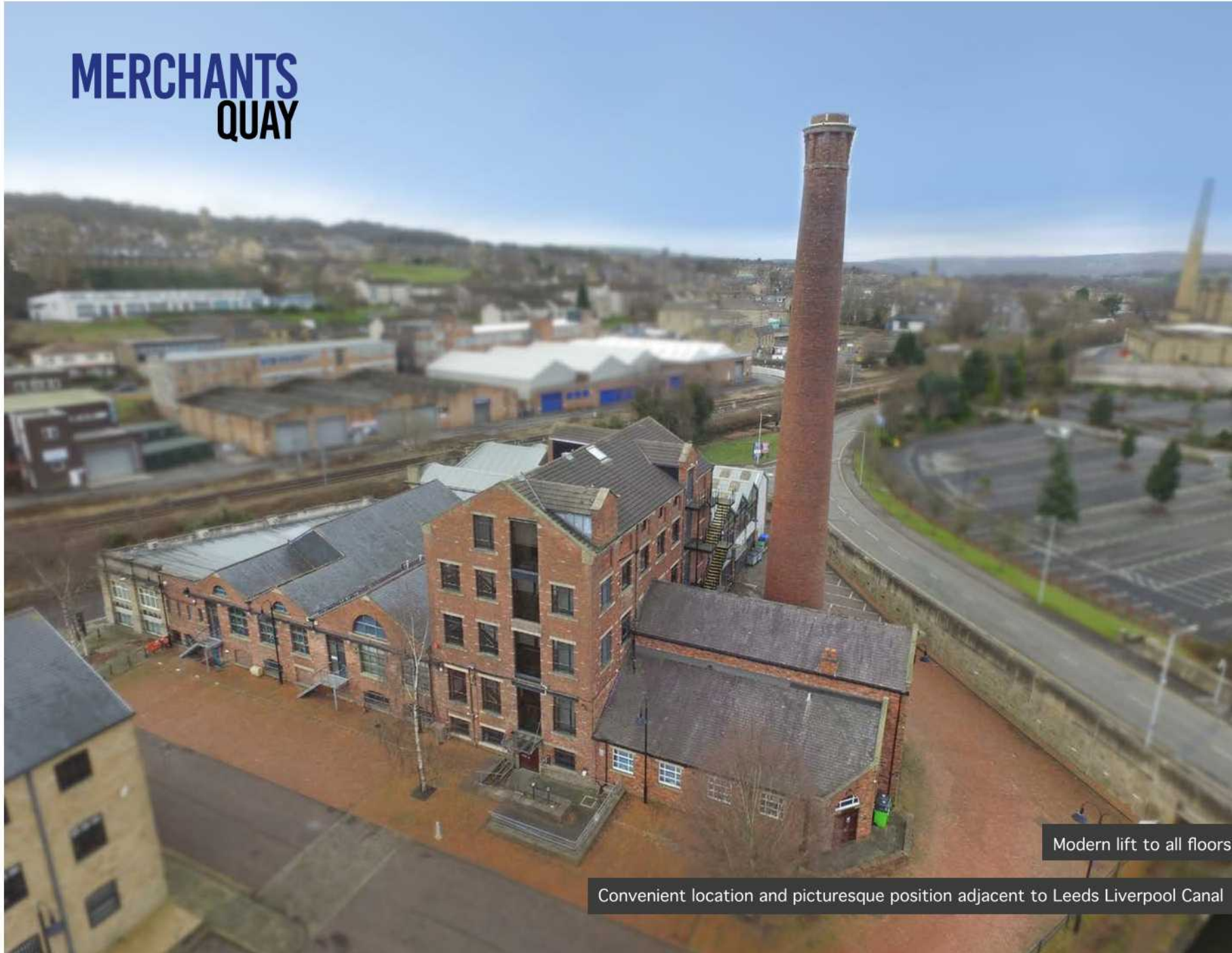
Modern lift to all floors