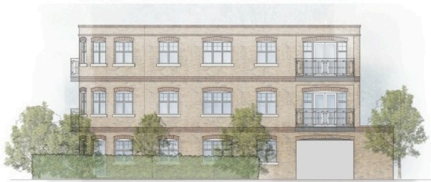
King Charles Road Proposed Elevation