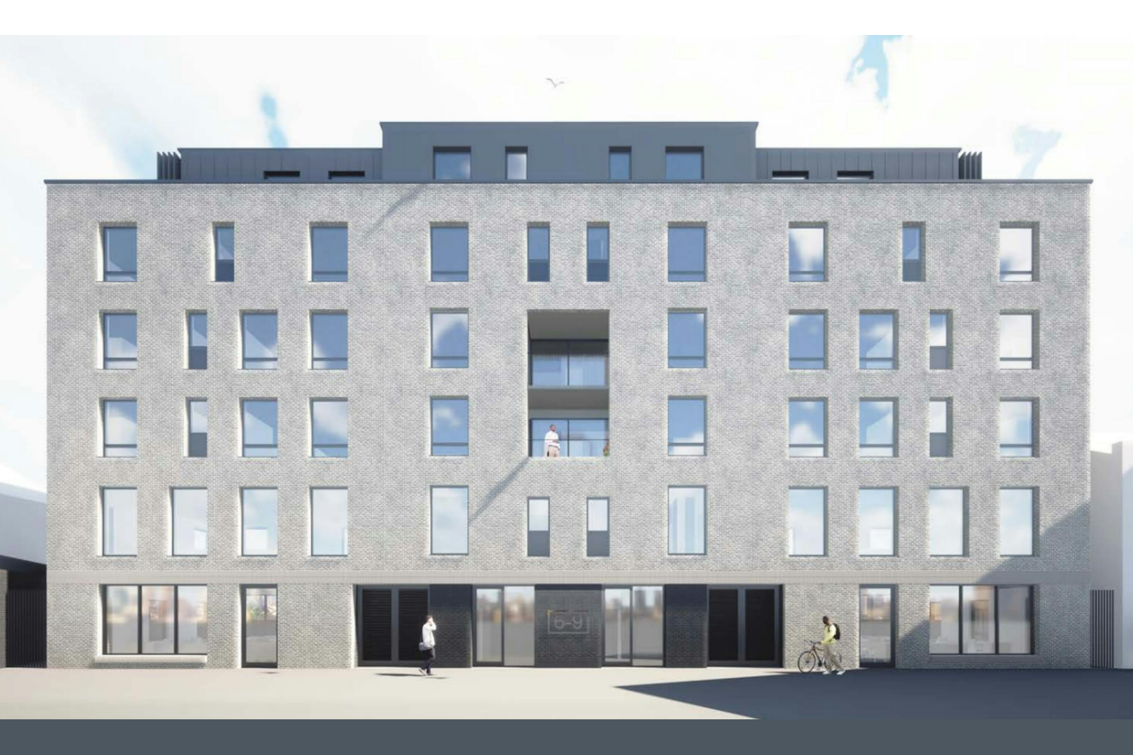
6-9 Rosina Street London, E9 6JH