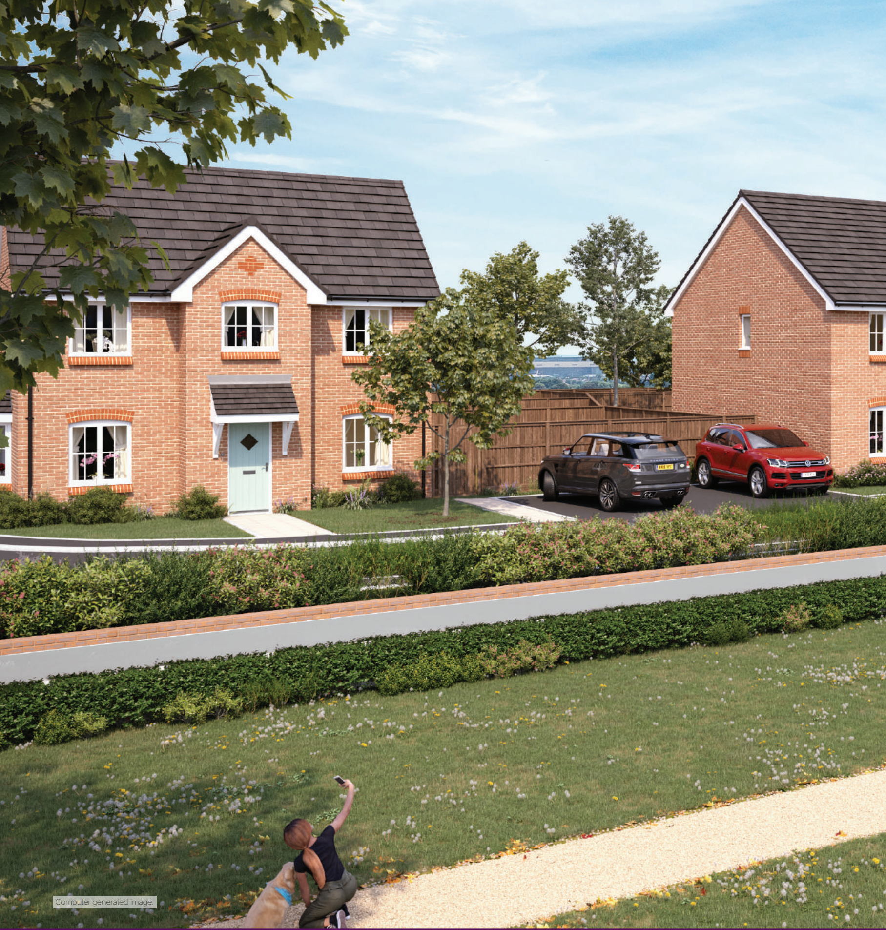
Computer generated image.