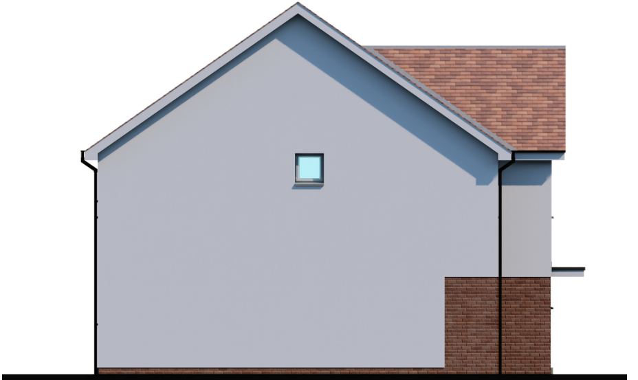
Left Gable Elevation