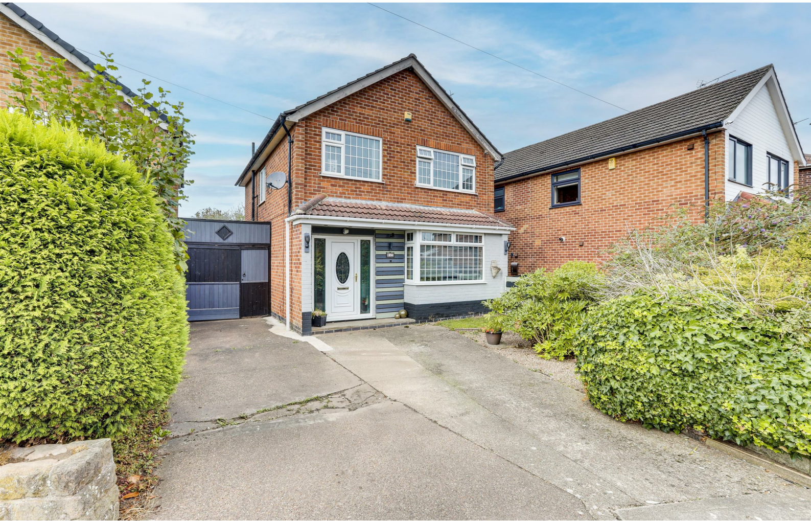
Erewash Grove, Toton, Nottinghamshire NG9 6EZ