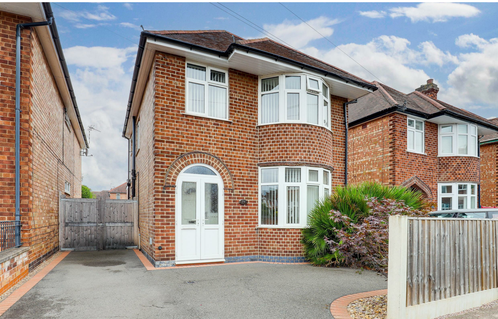
Reedman Road, Long Eaton, Nottinghamshire NG10 3FD