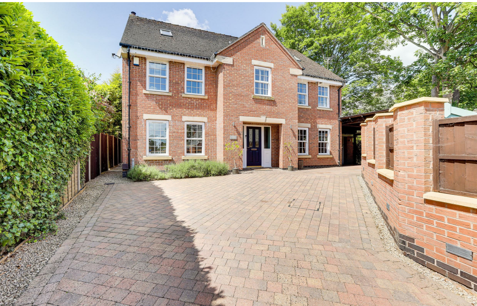
Meadow Close, Breaston, Derbyshire DE72 3EL