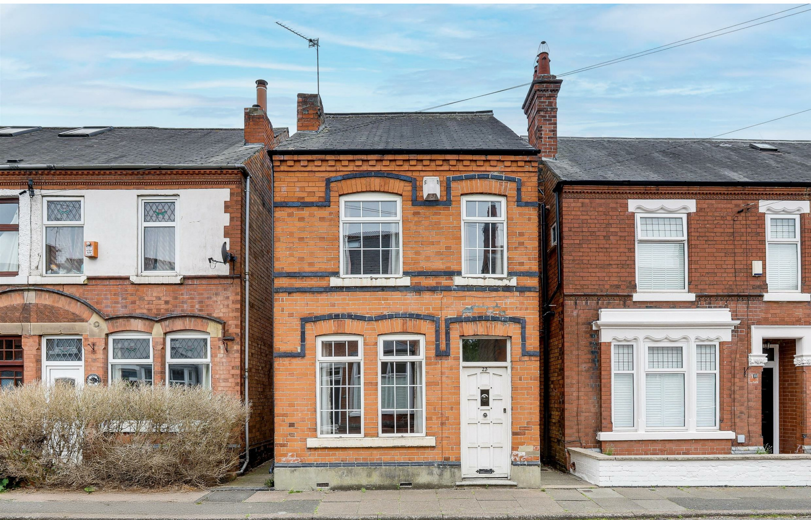
Curzon Street, Long Eaton, Nottinghamshire NG10 4FG