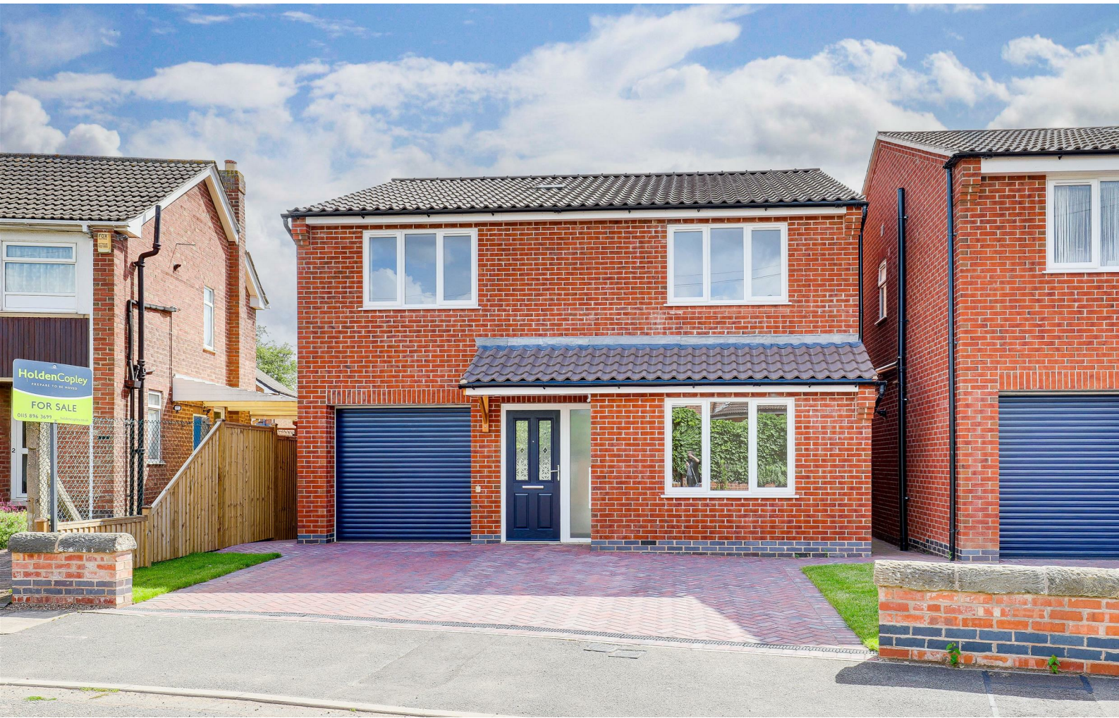
Wilne Close, Long Eaton, Derbyshire NG10 3AQ