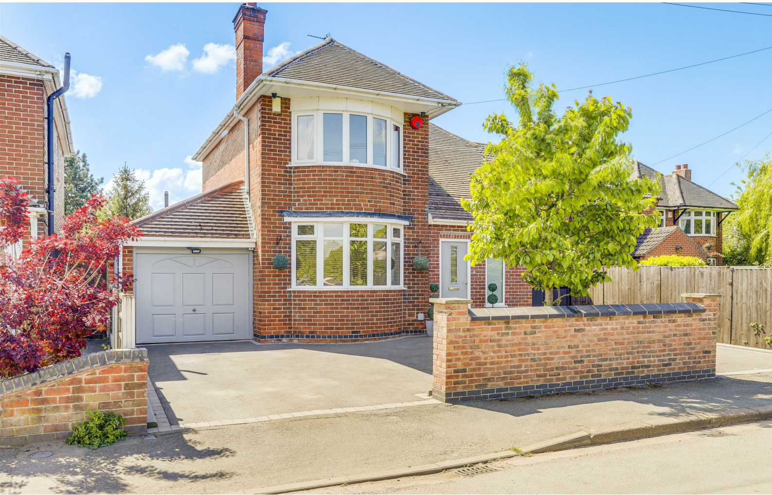
Meadow Lane, Long Eaton, Derbyshire NG10 2FQ