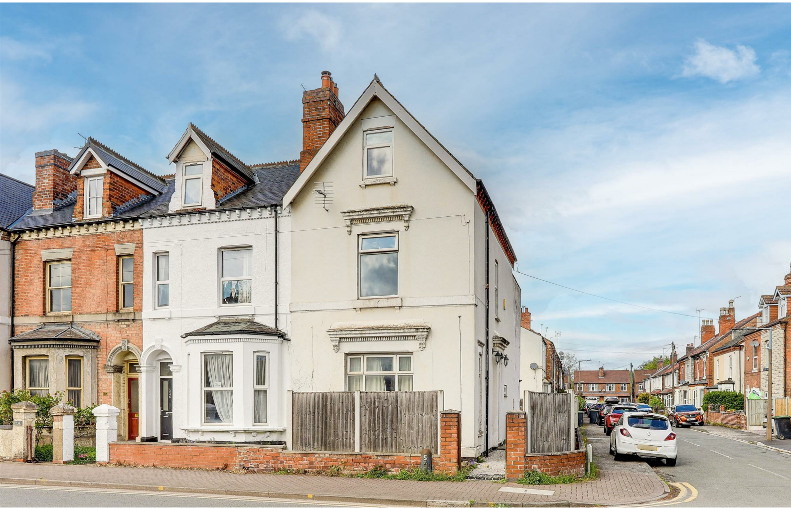
Queens Road, Beeston, Nottinghamshire NG9 2BG