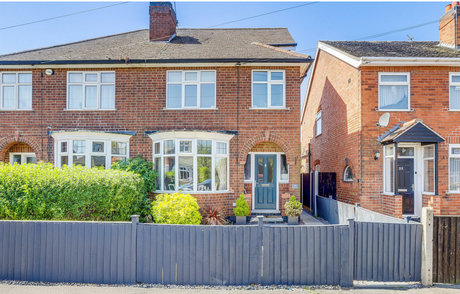
Roosevelt Avenue, Long Eaton, Derbyshire NG10 3GE