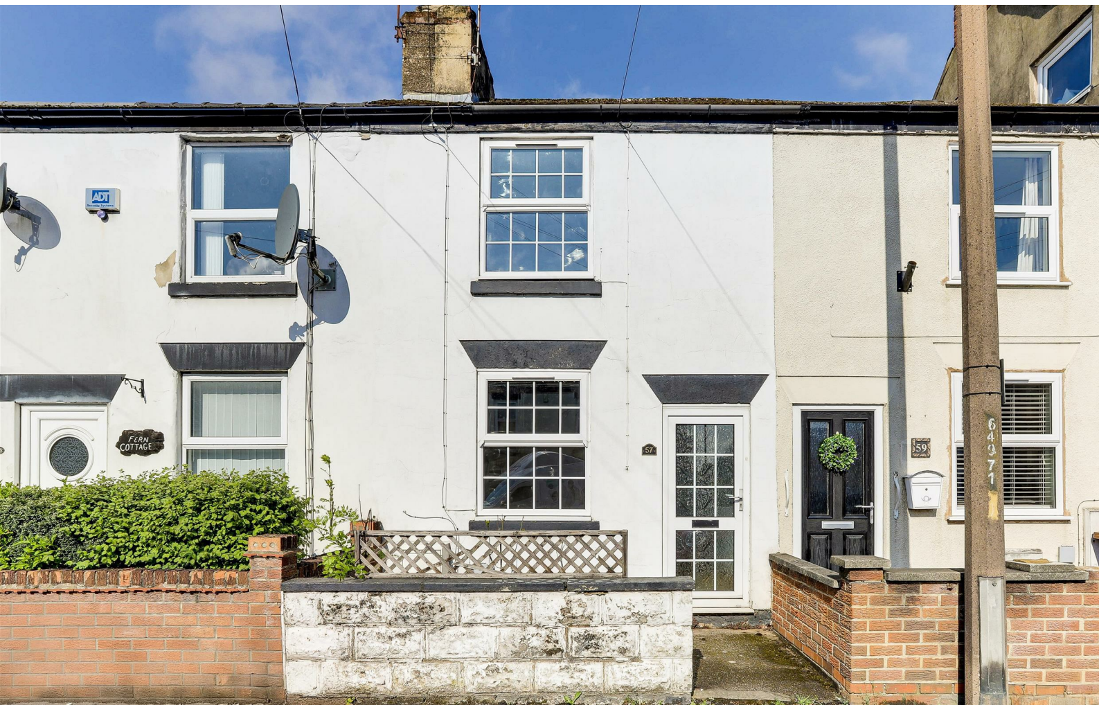
Victoria Avenue, Borrowash, Derbyshire DE72 3HE