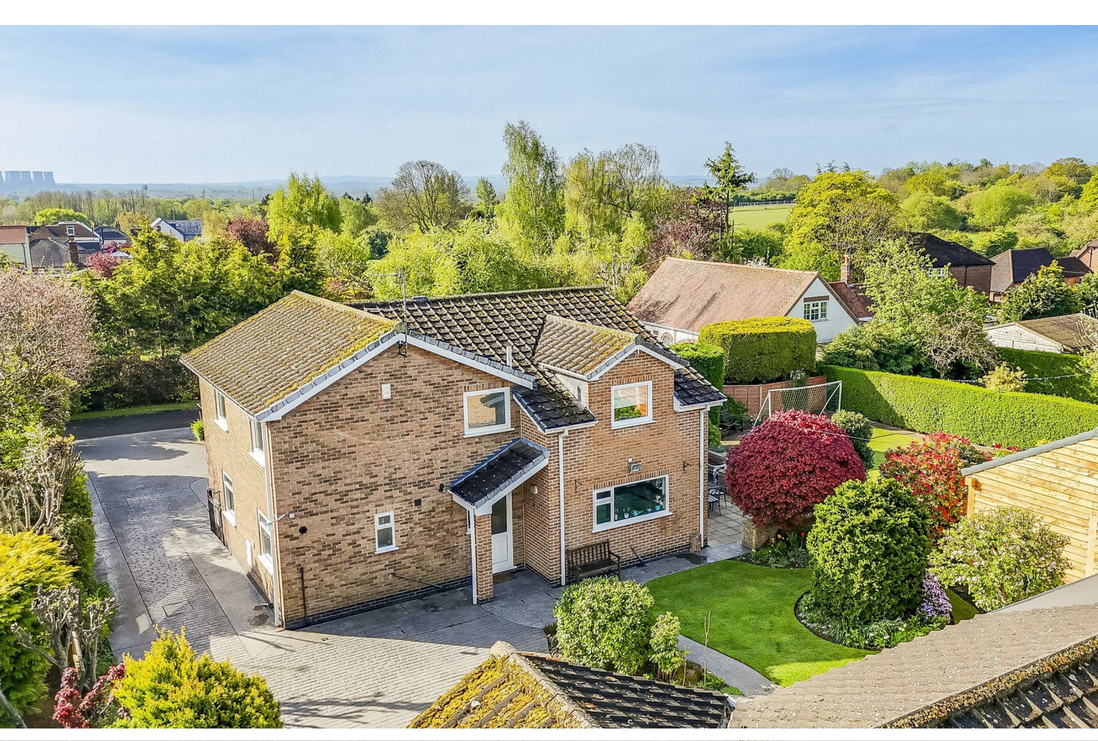
Cherry Tree Close, Risley, Derbyshire DE72 3TX