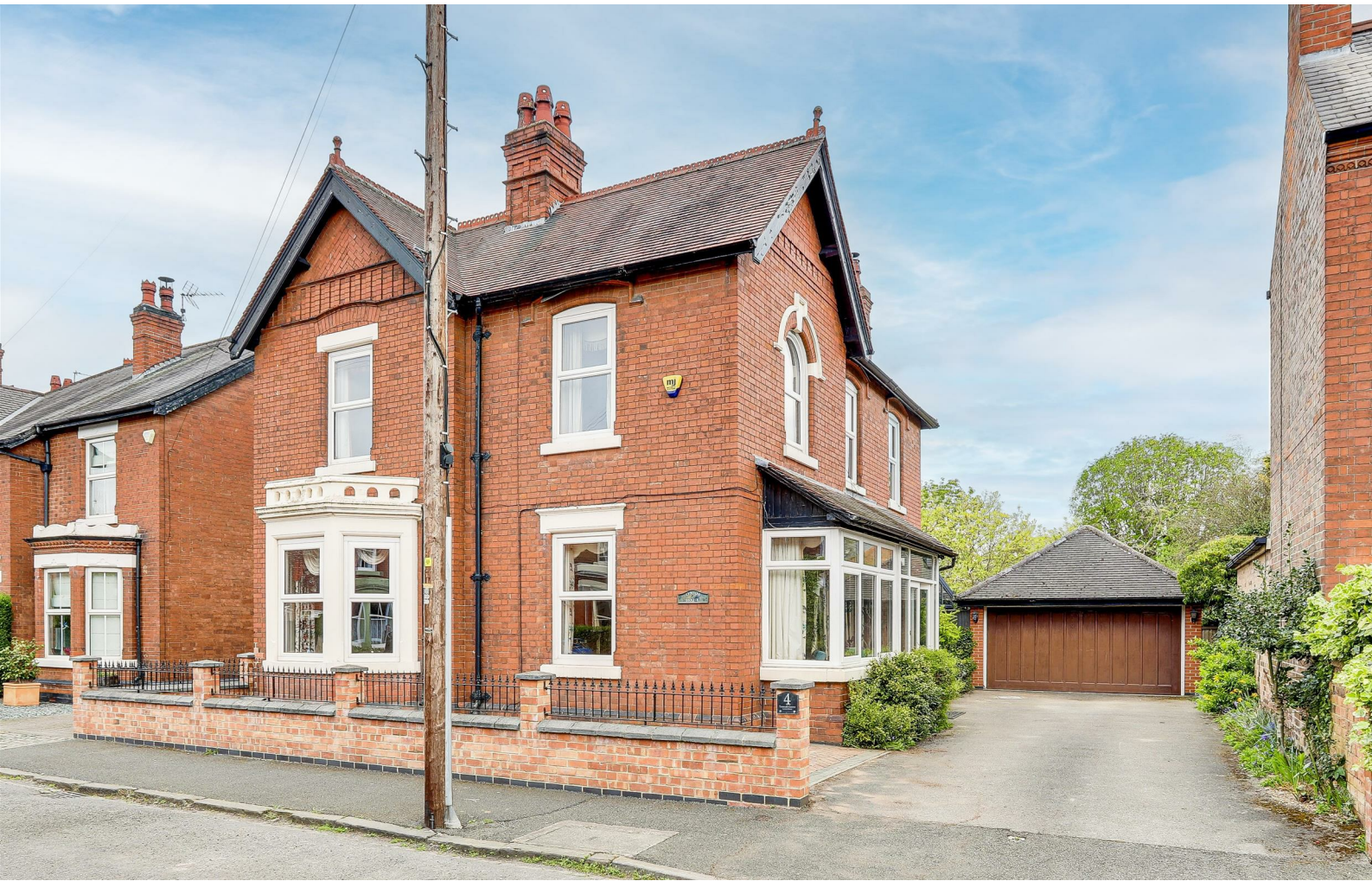
Trowell Grove, Long Eaton, Derbyshire NG10 4AZ