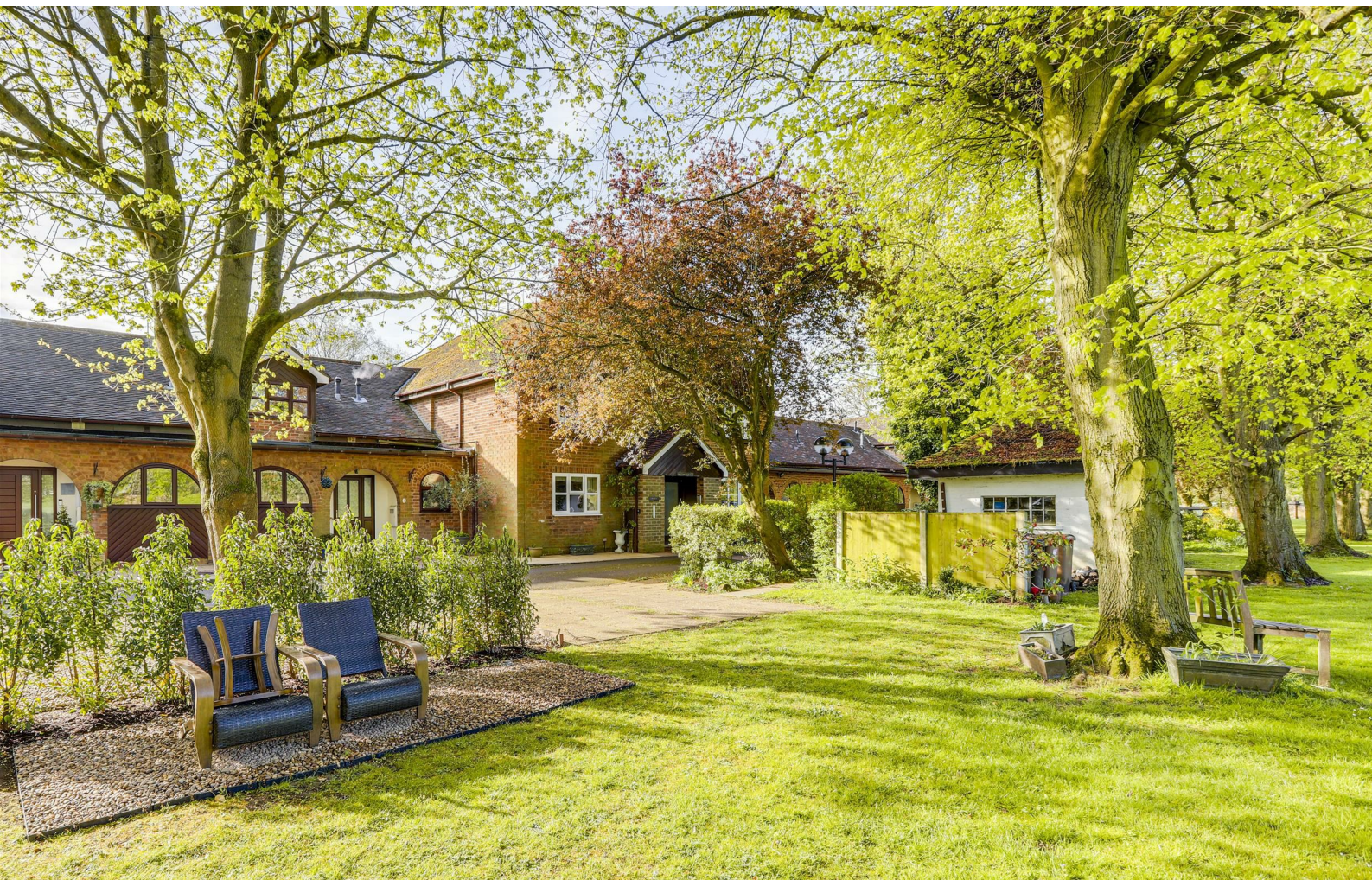
Maple Cottages, Risley, Derbyshire DE72 3WJ