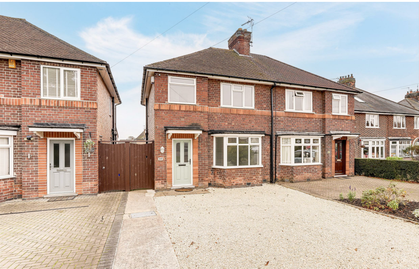
Longmoor Lane, Breaston, Derbyshire DE72 3BE