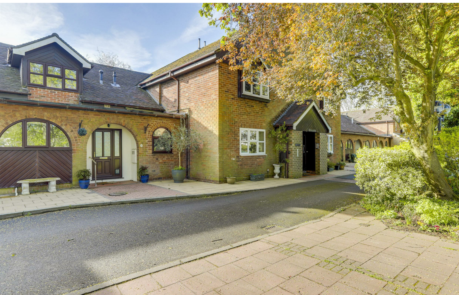
Maple Cottages, Risley, Derbyshire DE72 3WJ