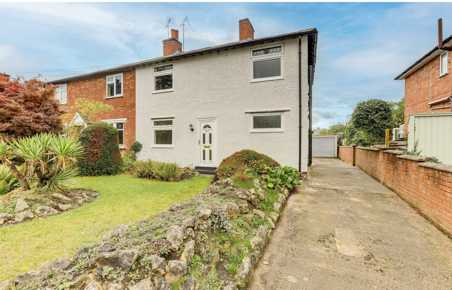
Draycott Road, Breaston, Derbyshire DE72 3DB