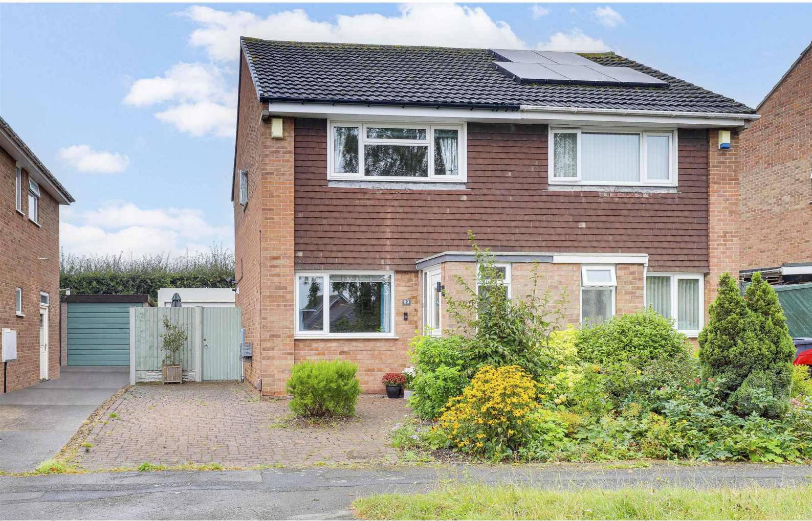
Latimer Drive, Bramcote, Nottinghamshire NG9 3HT