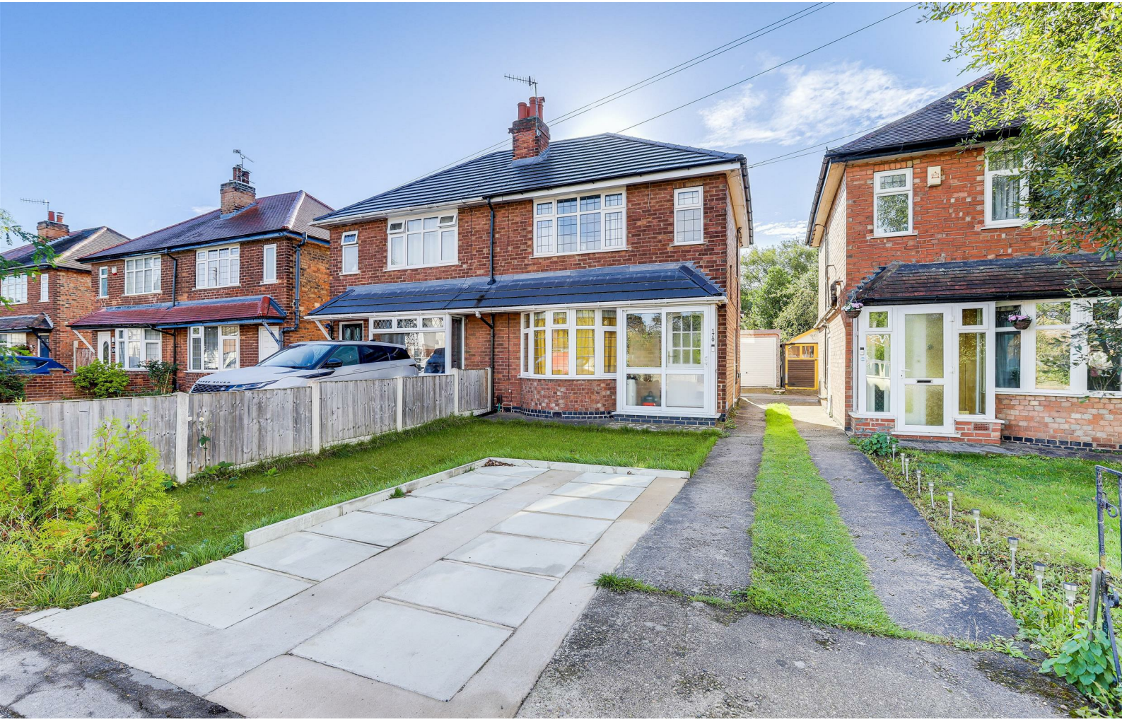
Long Lane, Attenborough, Nottinghamshire NG9 6DB