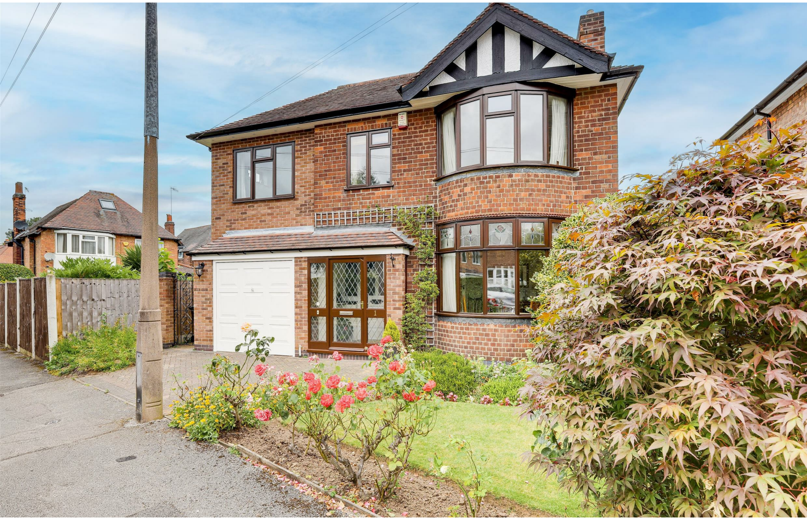
Valmont Road, Bramcote, Nottinghamshire NG9 3JL