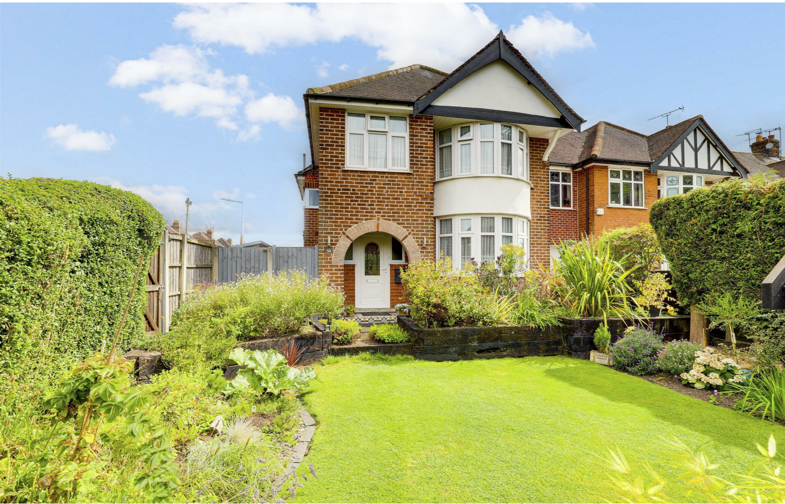
Tamworth Road, Sawley, Nottinghamshire NG10 3FB