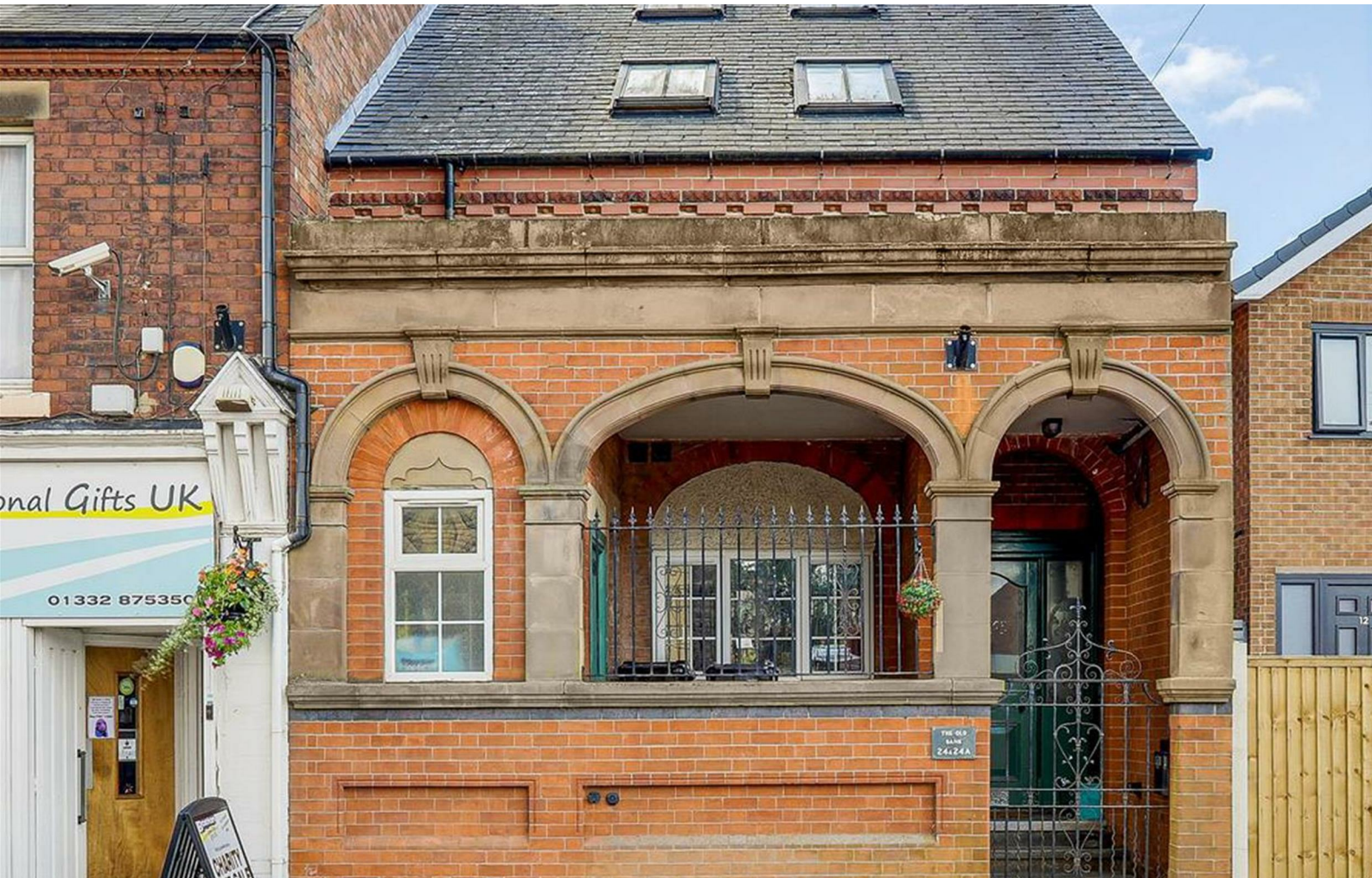
The Old Bank, Station Road, Draycott, Derbyshire DE72 3QB